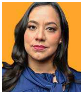
Rochelle Garza, JD United States Commission on Civil Rights