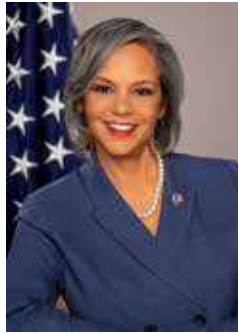
Cong. Robin L. Kelly, PhD (D-IL)